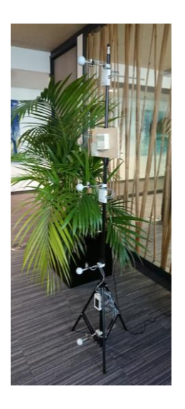
Fig. 2. The measurement stand used in a measurement location in the office building.

Fig. 2 shows the measurement stand used in a measurement location in the office building.